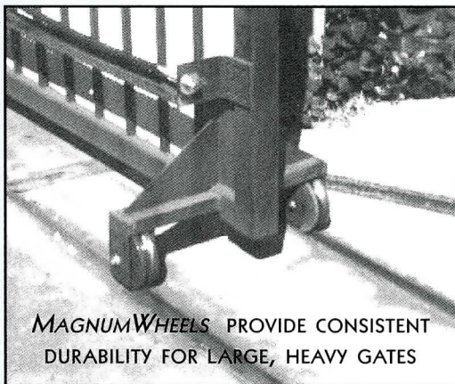
MAGNUM WHEELS PROVIDE CONSISTENT DURABILITY FOR LARGE, HEAVY GATES

THIS IS THE ONLY MACHINED SOLID STEEL PIPE TRACK WHEEL ON THE MARKET